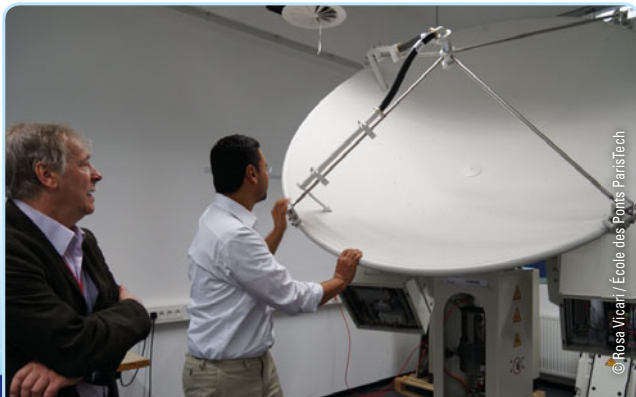
The dual polarisation X-band radar of École des Ponts Paris Tech.

Higher resolution data, more sophisticated models and decision tools are the drivers of innovation and the core of the Chair Hydrology for Resilient Cities.